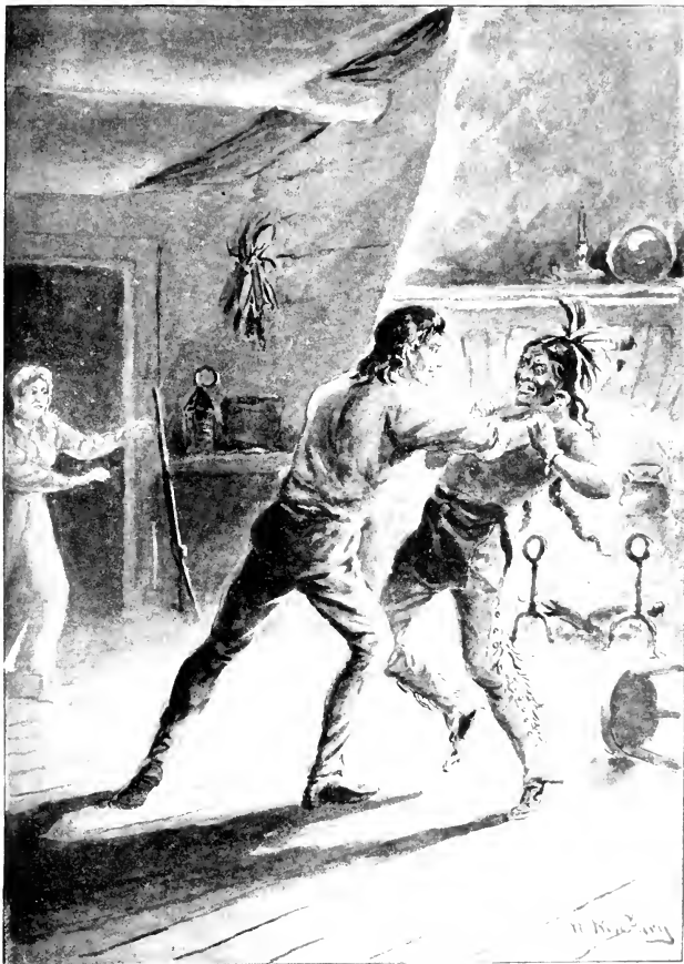
OSCEOLO AND GASPAR.